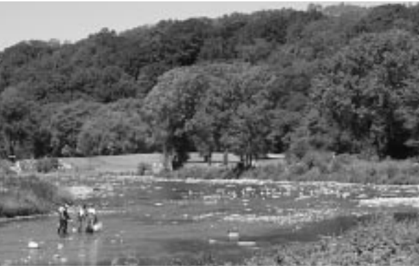
The Humber River

You can reach the suggested start and end point on public transit by taking the BLOOR/DANFORTH subway to Old Mill Station.