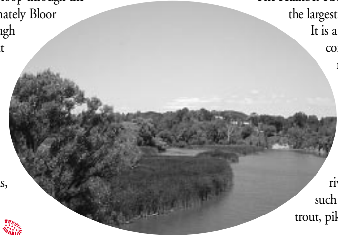
The Humber River

It is a significant corridor for migratory song birds and monarch butterflies. More than 60 species of fish live in the river including such sport fish as trout, pike and salmon.