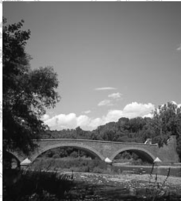
Old Mill Bridge